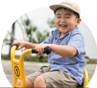
The Physical Child