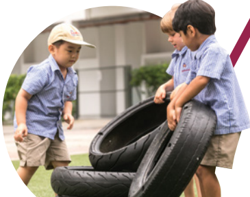
The Child in a Social Cultural Context