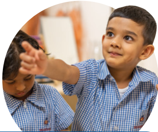
The Child as a Communicator