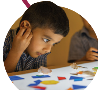
The Thinking Child