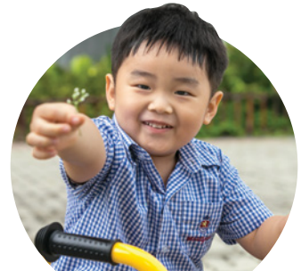
The Child as an Agent of Change